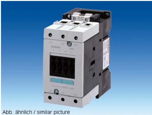
Abb. ähnlich / similar picture

CONTACTOR, AC-3 45 KW/400 V, AC 230 V, 50 HZ, 3-POLE, SIZE S3, SCREW CONNECTION